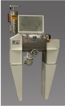
R&D Ribbon Blender for Fuel Cell Materials