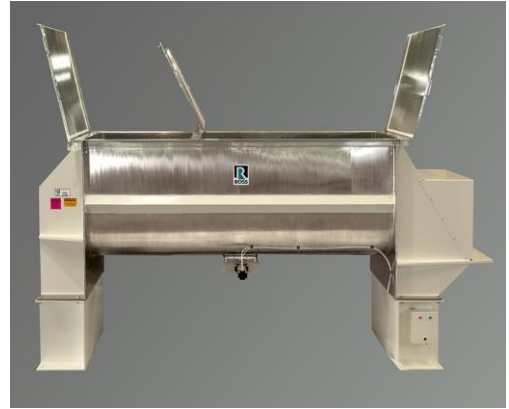
120-cu. ft. Sanitary Ribbon Blender for Flavor Concentrates