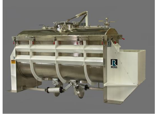
52-cu. ft. Ribbon Blender for Building Materials. Unit is supplied with pneumatic charging port and dual flush plug valves.