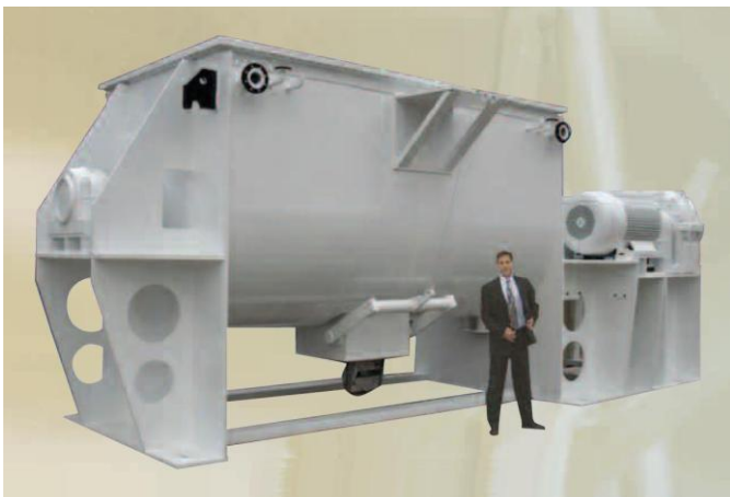
515-cu. ft. Ribbon Blender/Reactor built for a Petrochemical Company