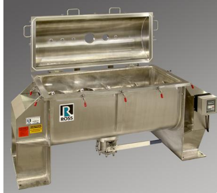
18-cu. ft. All-Stainless Steel Vacuum-Rated Ribbon Blender built for a Food Manufacturer