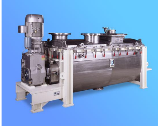
90-cu. ft. Ribbon Blender fabricated in Hastelloy for Polymer Processing.