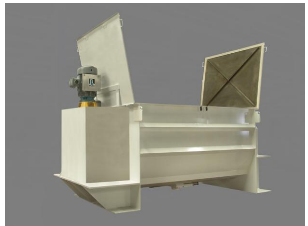
385-cu. ft. Carbon Steel Ribbon Blender for Ceramic Powders