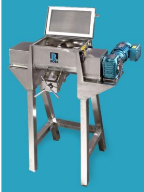
1-cu. ft. Laboratory Sanitary Ribbon Blender for Pharmaceuticals